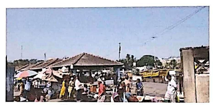
Photograph 4 Fish Market