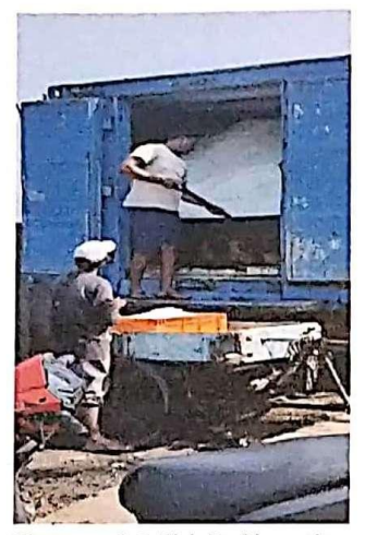
Photograph 3 Fish Refrigeration